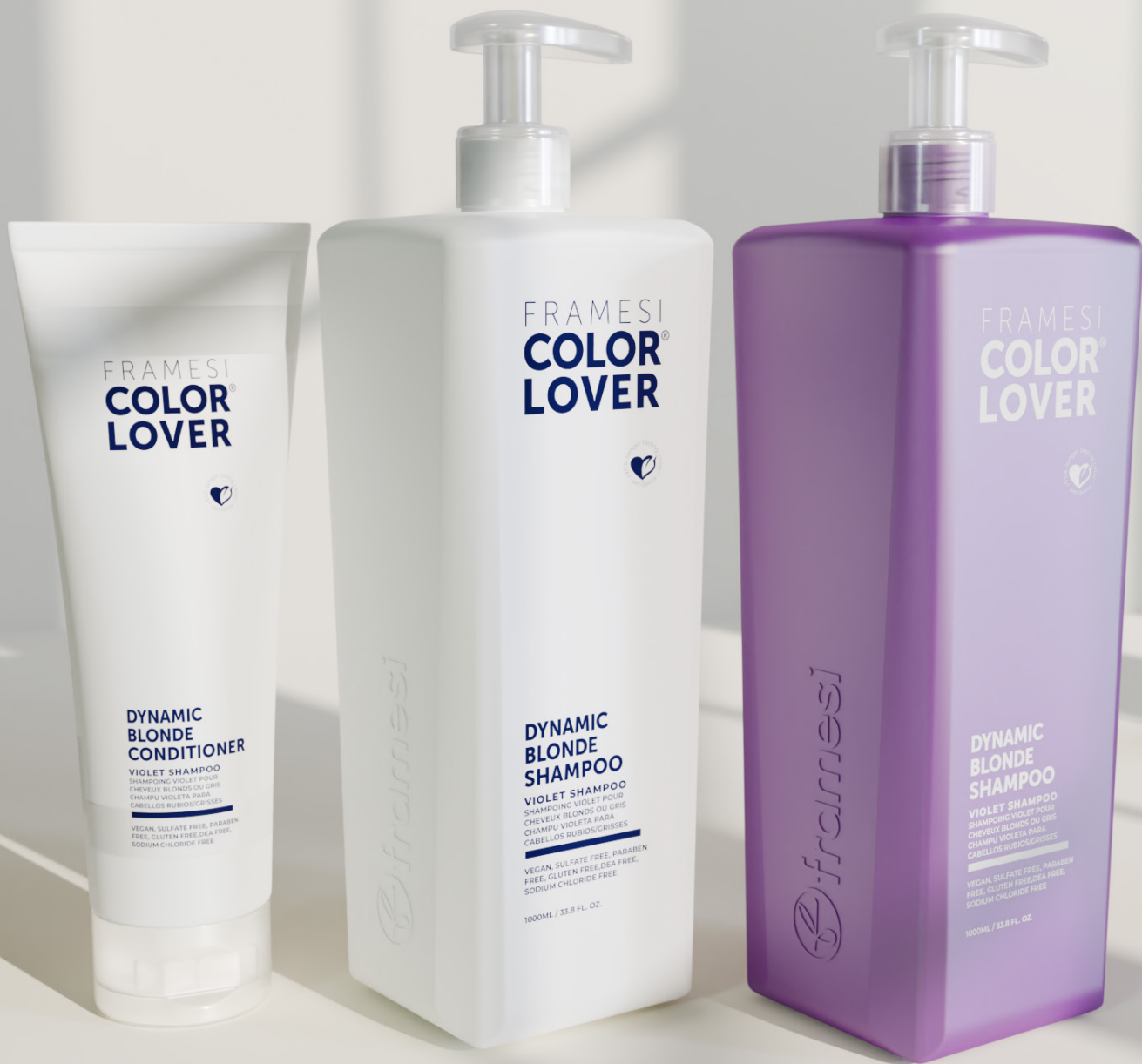
In this example the Dynamic Blonde logo on the Morphosis Mold