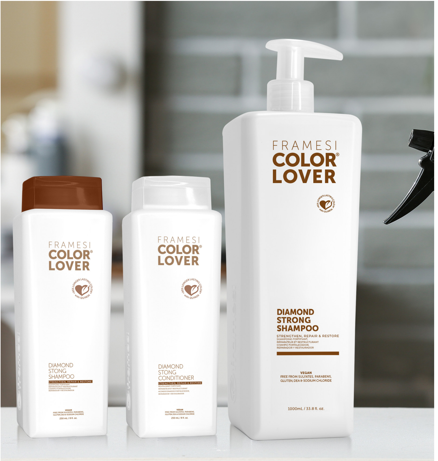
In this example the Diamond strong logo on the Morphosis Mold